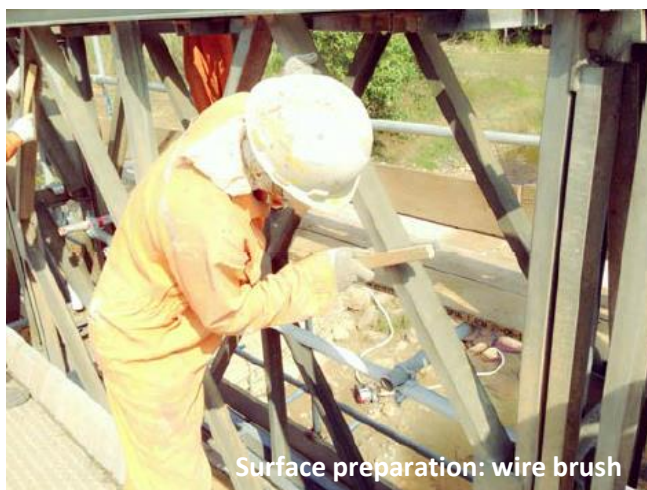
Surface preparation: wire brush