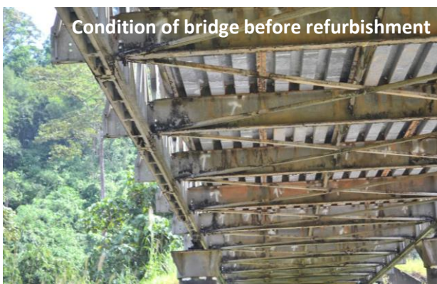
Condition of bridge before refurbishment

In February 2014, TOTAL Bridge USB 100B located in Myanmar, was refurbished with ZINGA.