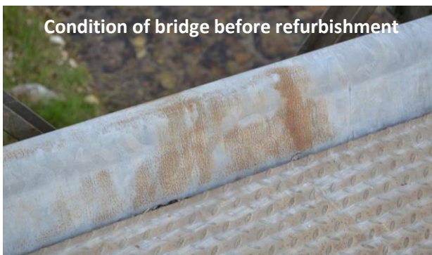
Condition of bridge before refurbishment

The hot-dipped bridge was in bad condition with several places of corrosion.