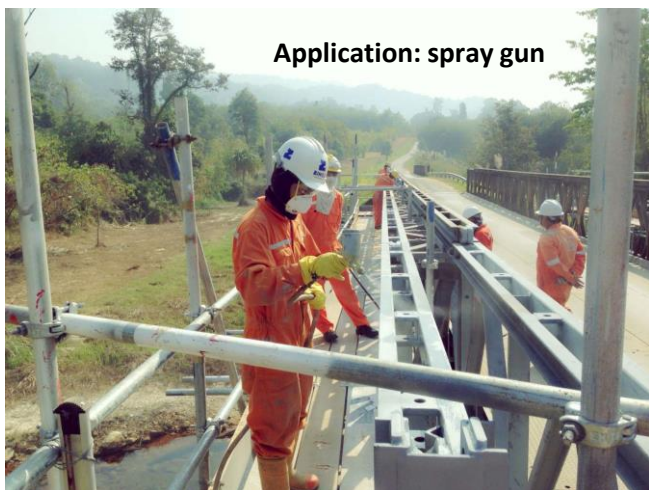
Application: spray gun