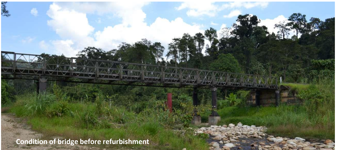
Condition of bridge before refurbishment

TOTAL S.A. is a French multinational integrated Oil and Gas company and one of the six "Supermajor" oil companies in the world. Its businesses cover the entire Oil and Gas chain, from crude oil and natural gas exploration and production to power generation, transportation, refining, petroleum product marketing, and international crude oil and product trading. TOTAL is also a large-scale chemicals manufacturer. The company has its head office in the TOTAL Tower in La Défense district, west of Paris. The company is listed Euro Stoxx 50 stock market index.