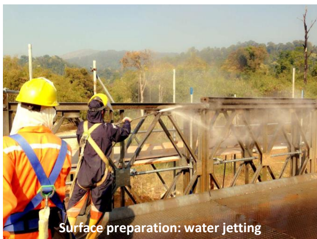
Surface preparation: water jetting